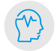
Virtual Behavioral Health