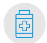
FREE LASO RX Discount Card