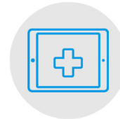
Virtual Urgent Care