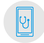
Virtual Primary Care

LASO Plus is an easy-to-use app that gives you and your family on-demand access across all 50 states to Primary Care, Urgent Care and Behavioral telehealth - all backed by the power of Walmart Health Virtual Care's network of nationwide providers. This is Streaming Healthcare™ .